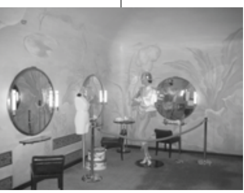
The Ladies' Powder Room

The Chandeliers were designed for this room by Edward Caldwell and were manufactured at the Caldwell Factory in New Jersey. Each chandelier weighs two tons. They are 29 feet long and are made of heat–resistant moltened glass. Of the total weight of two tons, one is of glass. There are 41 bulbs or lamps in each fixture burning a total wattage of 2,900. One 500 watt bulb is located in the base and forty 60 watt bulbs are distributed throughout the chandelier. Each fixture is attached by a steel cable to an electric motor