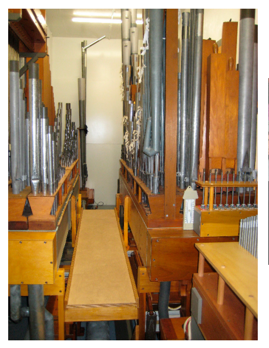
Large Wurlitzer chest on right