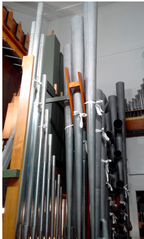
Tuba & top 12 notes of Clarion