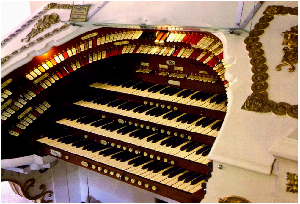
The Empire Wurlitzer console at Chorleywood

across the desk to me. Now off you go!’ It was just like that, all sorted in a couple of minutes. I got straight back to work feeling as high as a kite.