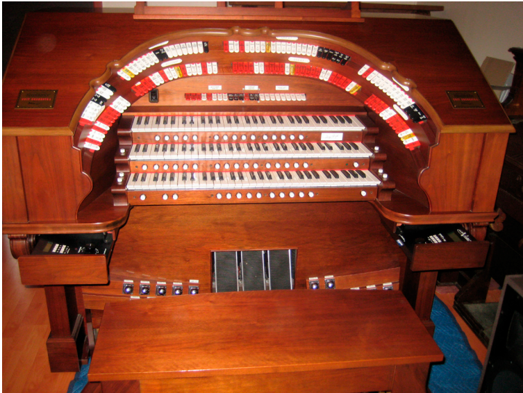
George Wright 319EX showing drawers under either side of the Console - left drawer is organ controls; right drawer is Allen Vista Midi controls