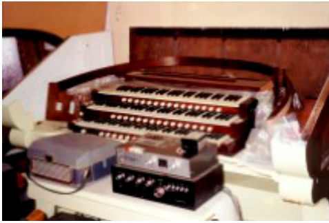
mto Christie three manual keyboard