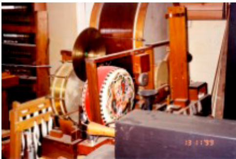
mto Christie Toy Counter